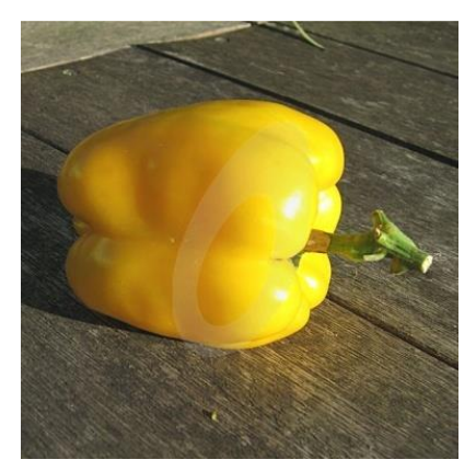
YELLOW WONDER