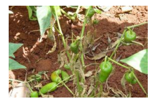
Bacterial wilt